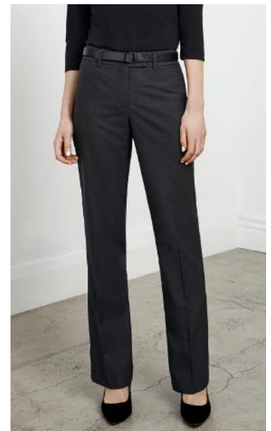
BS29320 Classic Pant 65% Polyester 35% Viscose Ladies 6 - 26