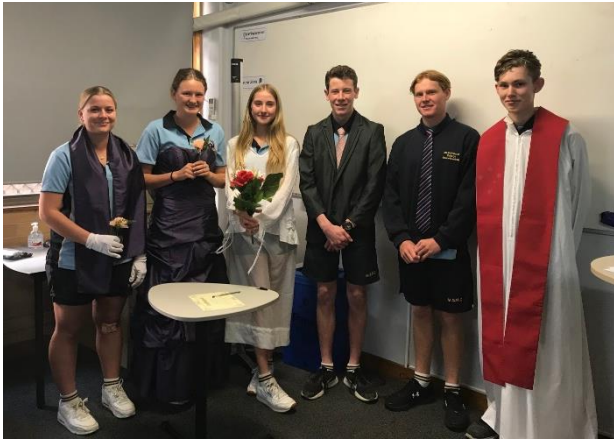
The Bridal Party of 10C