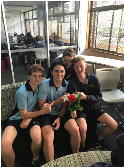
Caught the bouquet!