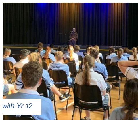
Bishop Greg talks with Yr 12