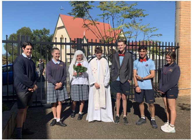
The Bridal Party of 10B